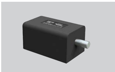
05 Roller Door and Gate Locks