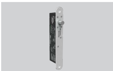
02 Drop Bolts