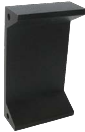
KESLP2250 Lip Extension 50mm