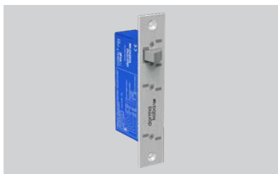
01 Side Load Locks