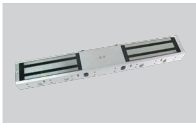
04 Electromagnetic Locks