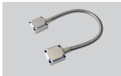
06 Cable Transfers