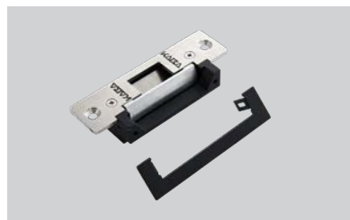
03 Electric Stikes